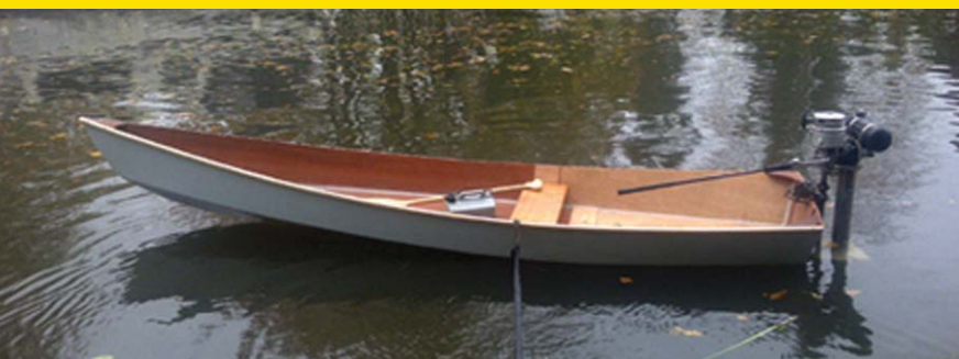
Slightly bow-up attitude with the motor on the transom and no crew aboard. Transom is too low, as motor sits too deep in the water for efficiency