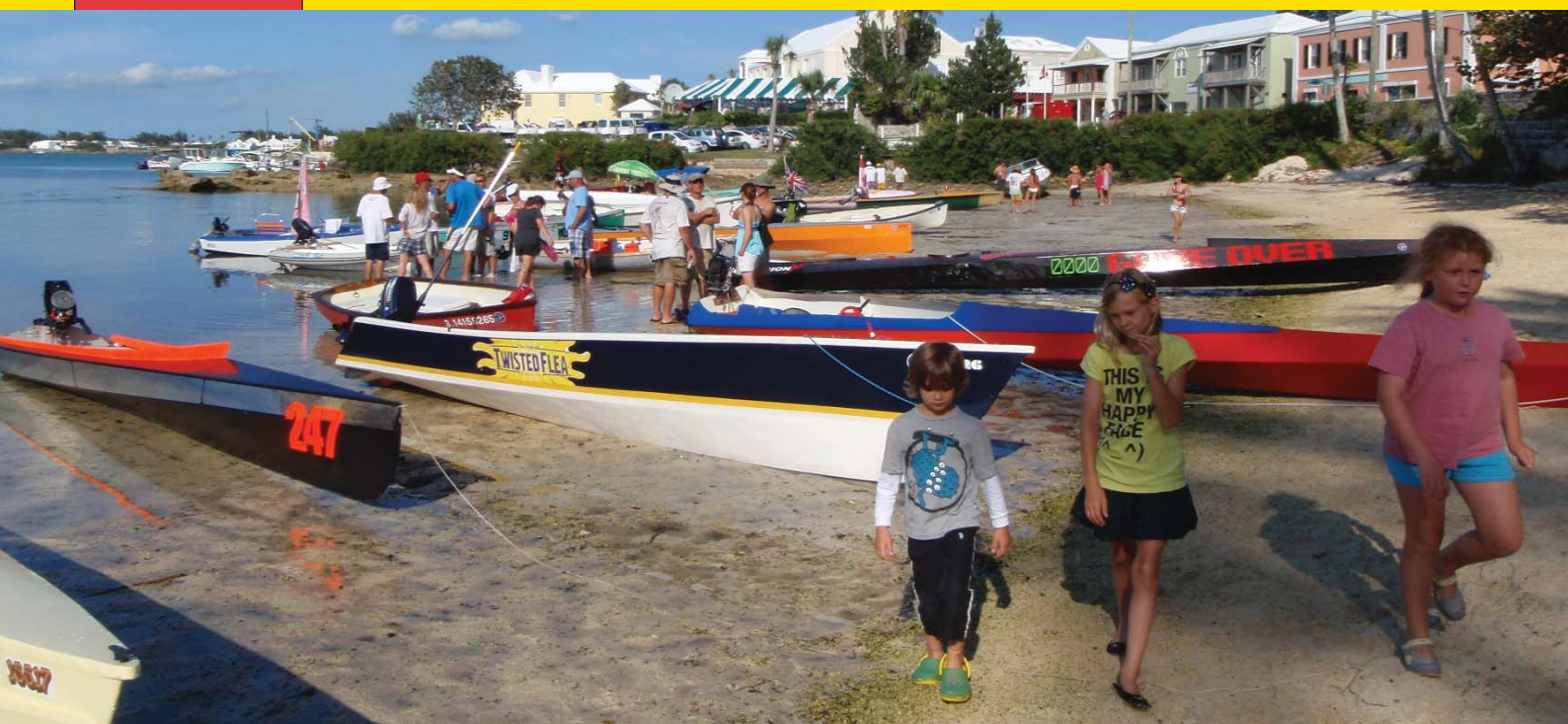
ABOVE: The scene on the beach next to Sandys Boat Club at the completion of the 2011 Heineken Round the Island Seagull Race. They start the Seagull racers early, in Bermuda, if these three budding competitors are anything to go by!! Seagull racing: a sport for the whole family!!

T he Seagull and Heineken gods were with us – what a wonderful day weather wise – an ideal Seagulling race day – winds were light – and crossing the harbour to Sandys Boat Club at 7.15am the water was glassy!