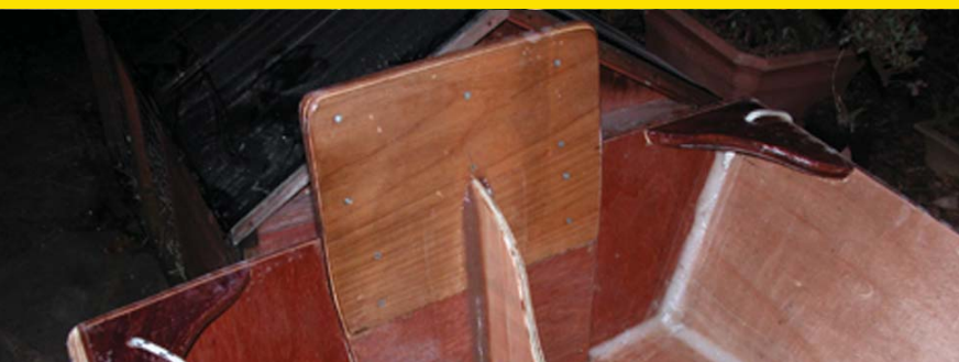
Modification to the transom to raise the motor demonstrates how far out this was initially. Now, anti-ventilation plate is approx. 50mm under water