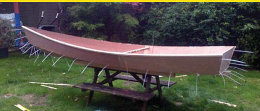
Simplicity of the stitch-and-glue construction method easy to see here